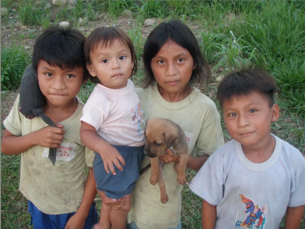
Photo journey of a normal day for a kid